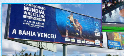
Salvador B, Brazil, 11 - 16 August 461 athletes from 53 countries took part