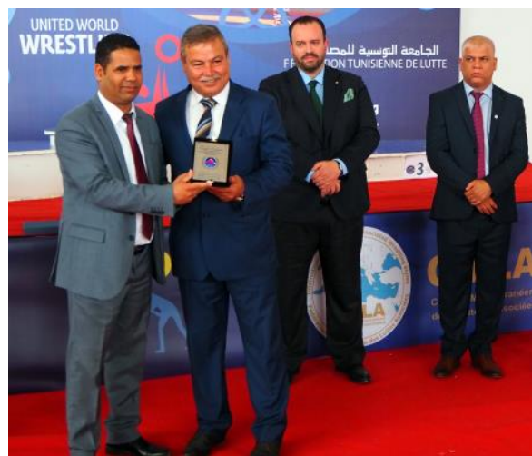
Programme du Championnat de la Méditerranée 2021 Xanthi Grèce

CHAMPIONNAT DES BALKANS / BALKAN CHAMPIONSHIPS U15 – Cadet (GR/LL/LF) XANTHI (GRE) 28 – 29.10.2021