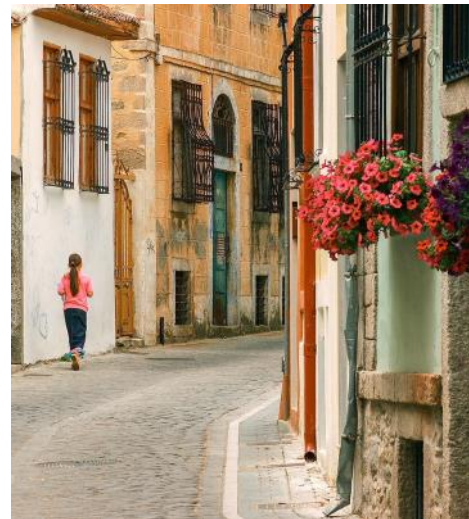
Some pictures on the City of Xanthi